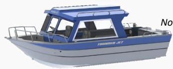
Note: Images shown may include optional features