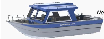
Note: Images shown may include optional features