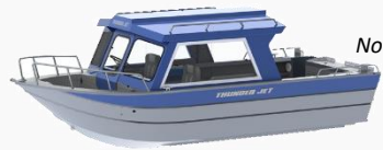
Note: Images shown may include optional features