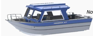
Note: Images shown may include optional features